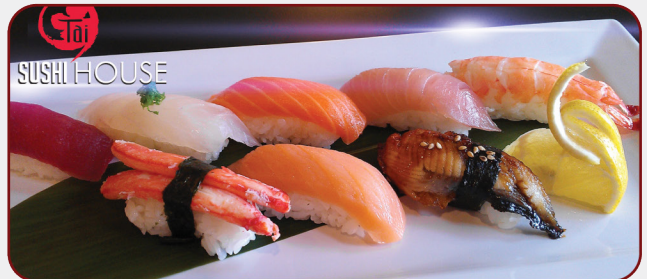
tai Special Combo

Tai Special Combo 18.50 1 tuna, 1 salmon, 1 tai, 1 shrimp, 1 yellow tail, 1 eel, 1 kani, 1 smoked salmon