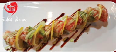
Double Shrimp Roll