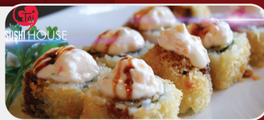
Craig Ranch Roll