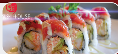
Rock N Roll